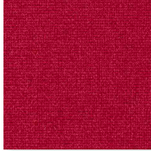
Medley · 63019 · Rojo