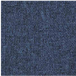
Medley · 66010 · Azul