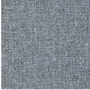
Medley · 66008 · Gris